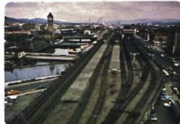
23. Today the viaducts obscure the river.

Every community has a heart. It may be a central business district, a civic center, a square, or even a building. The location and character of the heart is paramount as an expression of the character of the whole city. Spokane began on the river near Spokane Falls and Havermale Island. The heart of the City is still there, but cluttered and obscured. By removing this debris, the way is cleared for re-establishing the area in the public mind as the city's heart. The heart becomes a focus of high aesthetic, social, and cultural significance rather than just some street intersection which is basic to the plan concept of welding together the City, its people, and its river heritage.