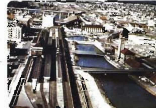
30. Today—Government Center.