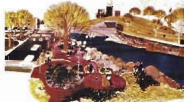
28. Tomorrow—The North River Bank.