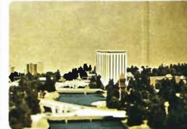
30. Tomorrow—A new Government Center.