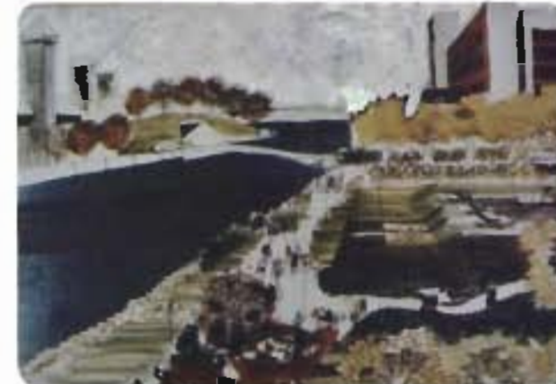
23. Tomorrow—This plan replaces the viaducts.