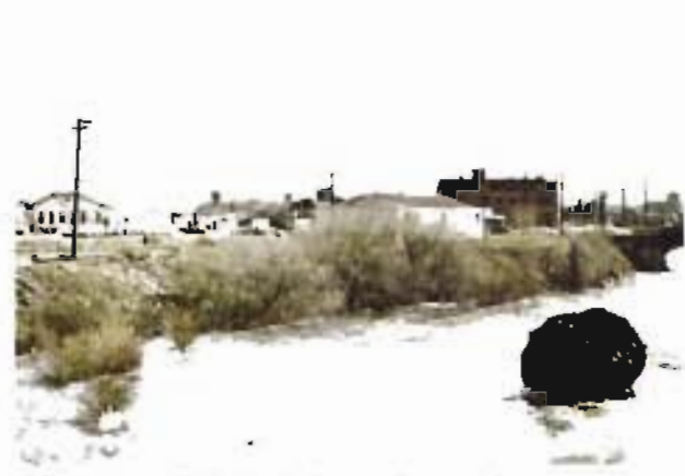
28. Today—The North River Bank.